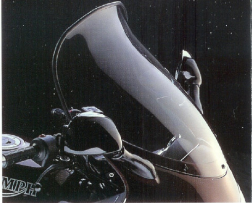
Right, High Screen (Polycarbonate) - a genuine Triumph accessory

Which Motorcycle?: "The new Trophy has recaptured the power and balance of the original bike, and added to the formula a much greater degree of style, individuality and quality of finish." and Bike Magazine's Phil West... "Predictably that (900) water-cooled DOHC 12-valve motor was just as gutsy and generally brilliant as ever. Its crisp carburation and stacks of low-rev and mid-range torque made for instant urge given a tweak of the throttle..."